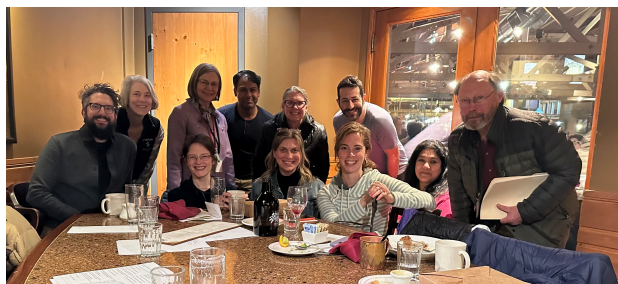
Your council at the strategic planning meeting

If you are interested in participating in the planning committee or have a topic/speaker in mind please contact us (mailto:acpalaskachapter@gmail.com?subject=AK%20ACP%20Committee%20Inquiry%20)!)